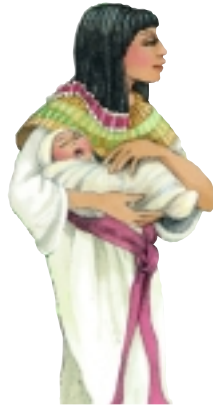
Pharaoh's daughter showed courage by rescuing a Hebrew baby.