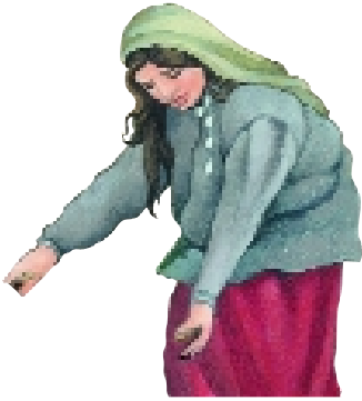
Moses's mother showed courage by disobeying a bad law and saving her baby.

Who showed courage in today's Bible story?