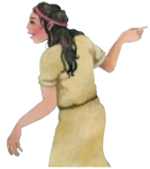
Moses's sister showed courage by watching over her brother and offering to find someone to care for him.

The Bible has many stories about courageous people. But there are people today who show courage too: